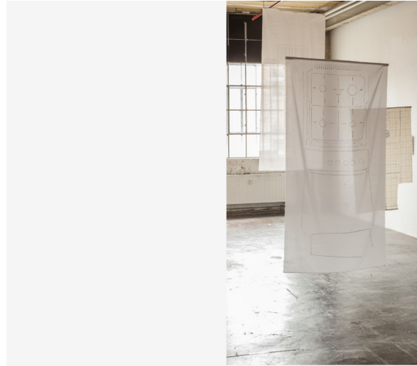
Existential Needs (detail) 2016 Installation, Oil stick on fabric.