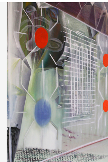
Reproductive Scream 2016 Oil on canvas 110 x 80 cm.

Leipzig International Art Program, Spinnerei, Germany, 2016.