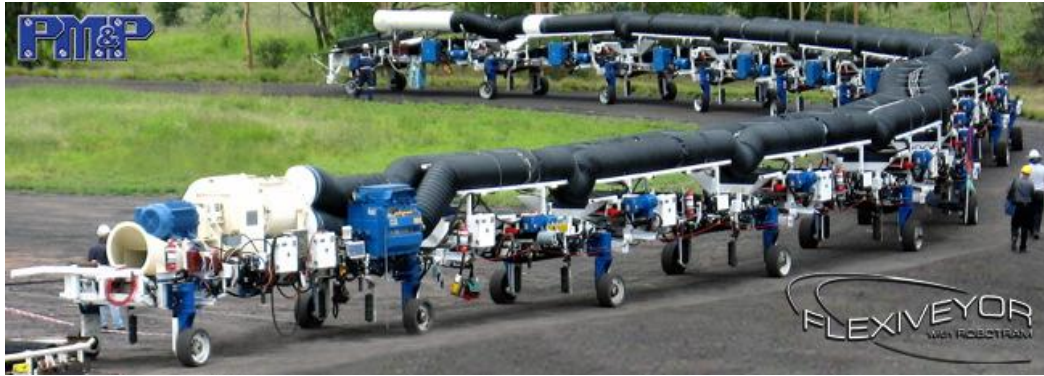
Figure 1 - Flexiveyor linear mining system (Diversified Mining Services 2010) flexible belt conveyor

Various flexible conveyor trains have been produced including both floor mounted and roof mounted continuous conveyor systems. Both systems offer some degree of operational flexibility. The discharge end of the flexible conveyor runs above the section conveyor. This enables the flexible conveyor to discharge onto the section conveyor as the flexible conveyor follows the continuous miner through the development sequence. The face end of the flexible conveyor is attached to the rear of the continuous miner or is self-propelled and kept at that position. Both roof and floor mounted flexible conveyor systems were trialled in Australian mines during the late 1980's with limited success.