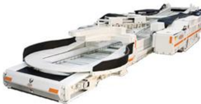
Figure 3 - Joy continuous chain haulage (Joy, 2010)

Chain conveyors (Figure 3) consist of four basic units: a breaker car module, conveyor bridge module, mobile bridge module and rigid haulage system. The system configuration and number of these units depends on individual mine application and production requirements. Systems can be up to 200 m of flexible chain conveyor with a feeder breaker behind a continuous miner. From the chain conveyor the coal is transferred via a belt interface onto the section belt. Chain conveyor systems often have a lower profile and thus are more suitable for lower seam workings.