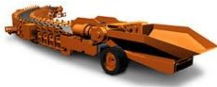
Figure 2 - 4FCT01 (Joy, 2008)

The Joy 4FCT01 (Figure 2) is available in lengths up to 128 m and requires one operator.