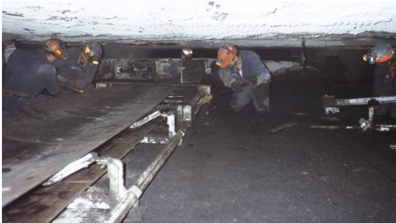
Figure 4 - Temporary belt support (S and S Sliders, 2011)

Joy's system requires a take up unit and has a length of 12 m, where CONSOL's temporary belt support system is 80 m long and has an optional take up unit. There is the potential for the continuous miner to be connected directly to the section conveyor when driving the belt road.