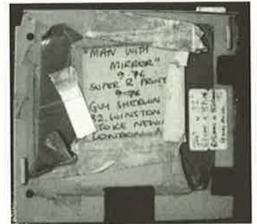
Guy's original film canister...

From Lucas Ihlein, 'Pre-digital new media art', Realtime 66, April-May 2005, http://www.realtimearts.net/article.php?id=7779