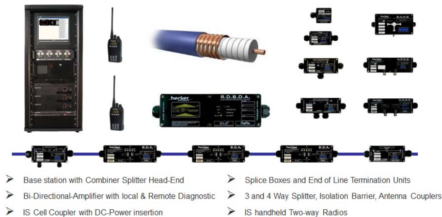
Figure 1 - Becker communication system components

Some aspects of such Communication systems as shown in Figure 1 are: