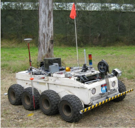
Figure 2 - Phoenix skid steer vehicle used to evaluate the performance of the inertial navigation systems

At the start of each trial the reference point on the Phoenix is placed on the start marker and the inertial navigation system is initialised with the absolute coordinates of the start location. The Phoenix is then instructed to autonomously navigate to the end coordinates using only vehicle position and attitude information provided by the inertial navigation system. The vehicle travels at a slow walking pace and in accordance with a pre-programmed mission plan periodically stops for a short duration and reverses for a short distance before moving ahead again. This motion profile approximates the motion of the CM production cycle and allows the inertial measurement unit to take advantage of Zero Velocity Updates.