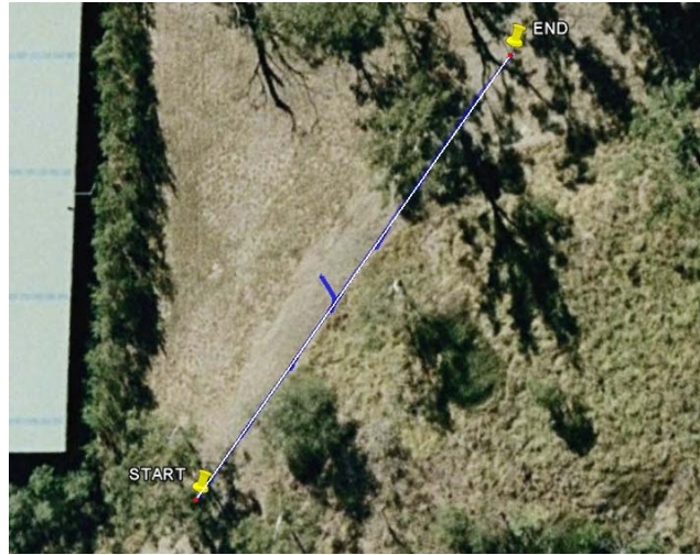
Figure 3 - Natural ground test track used for inertial navigation system evaluation located on the grounds of the CSIRO research facility

Around the mid-point of the mission the vehicle is taken out of closed-loop control and is driven under manual (remote) control through a sharp left turn and a short distance off track. It is then driven back on track where closed-loop control is resumed. This manoeuvre simulates some aspects of a niche or cut-through construction which is another less frequent component of the CM production cycle. The vehicle automatically stops when it reaches the mission end point.