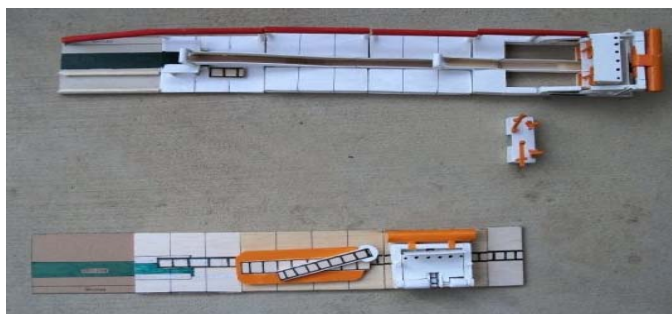
Figure 1 - Intake road heading equipment with the vent tube on the right-hand side

Where a heading machine is used, it would be connected to the inbye end of the sliding floor by two hydraulic rams, enabling it to sump forward, rip down and retract, cutting the cusp. In this case, the sliding floor would be about 0.3 m thick. A standard shuttle car would ride on it, doing nothing until required to drive the cut-through. Figure 1 shows the intake road equipment with the vent tube on the right-hand side. The cutter for the cut through, the associated shuttle car and the short elevating conveyor are carried on the sliding floor until they are in position to drive the cut through.