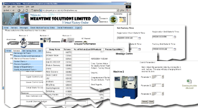
Figure 2: Interfaces and Screenshots from the Virtual Factory

The students can access the factory floor, choose certain machines, change the parameters and download product output data, read messages set by the lecturers, read tutorials and access the overall groups' performance ranking list, as illustrated in Figure 2. Lecturers or administrators have full control of the online simulator. They can set up