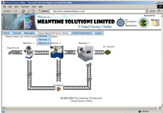
Figure 1: The Virtual Factory Workshop Layout

time a group of students log in, the simulator will start running and record data into the database. The data will accumulate and be collected into the spreadsheets by downloading a server-generated Excel file. When the students log into the system, the data is calculated, and they will view the factory running continuously at the server side.