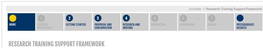
Figure 2. Navigation bar of Avondale's Research Training Support Framework, available at http://www.avondale.edu.au/research-training/