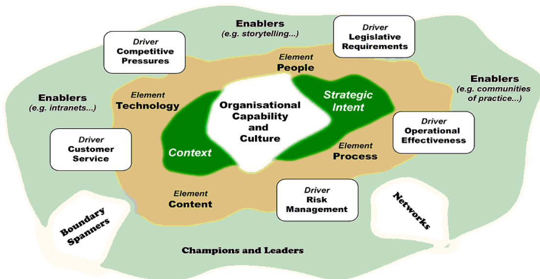
Figure 2 A visualisation of the Knowledge Eco-System from the Australian KM Standard (AS 5037—2005)