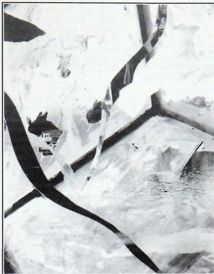
Blackwattle Bay XII 1992 by Peter Jones

If this understanding is to be expressed to others it must be interpreted and represented. The re-presentation gains meaning from within the framework of its cultural vocabulary. The subsequent interpretation of symbols depends to a great extent on the experiences of the viewer as well as the artist. Language