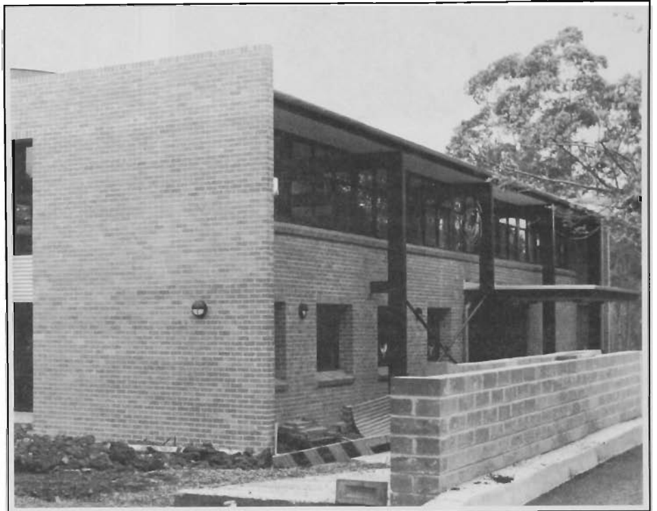
Building and Grounds' new premises

The move will free much-needed space in Administration.