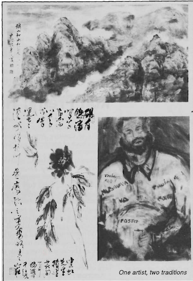
One artist, two traditions