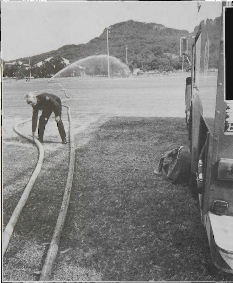
How to water playing fields in a drought