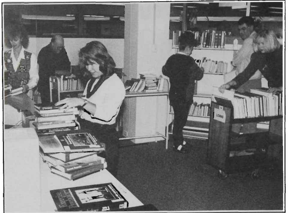
The loans team maintaining service quality despite an 18 percent increase in loans last month.

These changes include: more items for loan to all user groups and the availability of an additional terminal