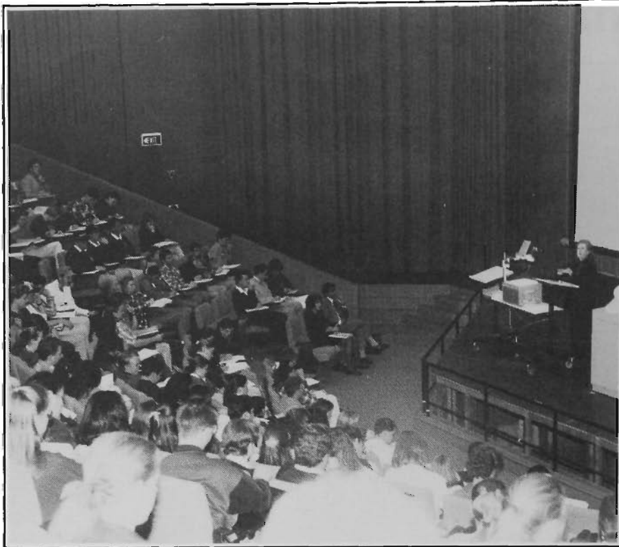
HSC students enjoyed the 'state-of-the-art' facilities in the Hope Theatre

Neither elaborate entertainment nor provision of board is required.