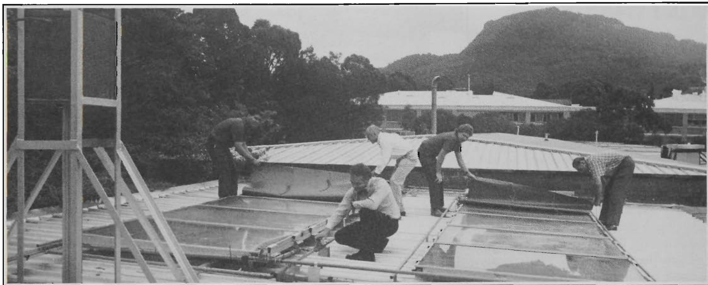
Work continues on the new solar-powered air-conditioning system

The University is continually increasing the number of links with Japan and expects to send exchange students to Obirin University (agreement already signed), Tsukuba University and Kobe University next year.