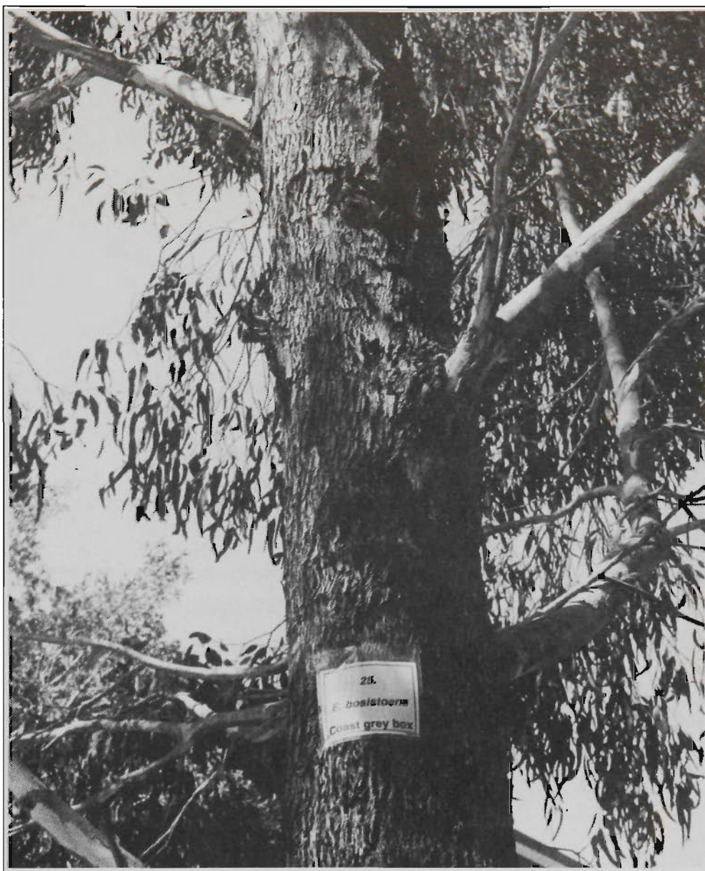
A specimen on one of the two eucalypt walks on campus

As a result, the native tree plantings on the campus are well established and form part of the Keira Green Corridor which is being developed from the escarpment to the coast.