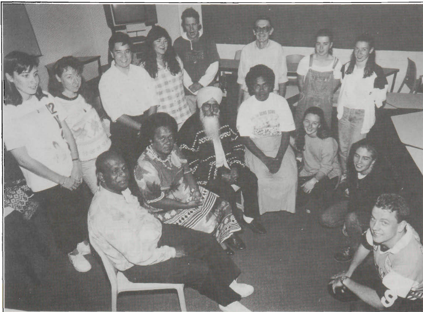
Representatives from the Fijian Ministry of Education with staff and students from the Faculty of Education