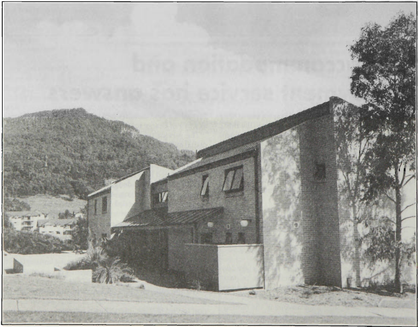
University Lodge. The front entrance off Northfields Ave. Kooloobong is in the background

Bookings: C/- University Union (042) 29 7833. Fax: (042) 26 4280