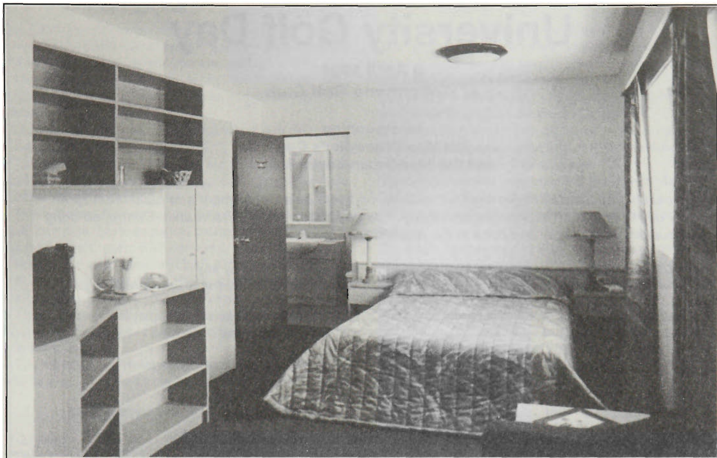
Inside one of the studio rooms – attractively decorated