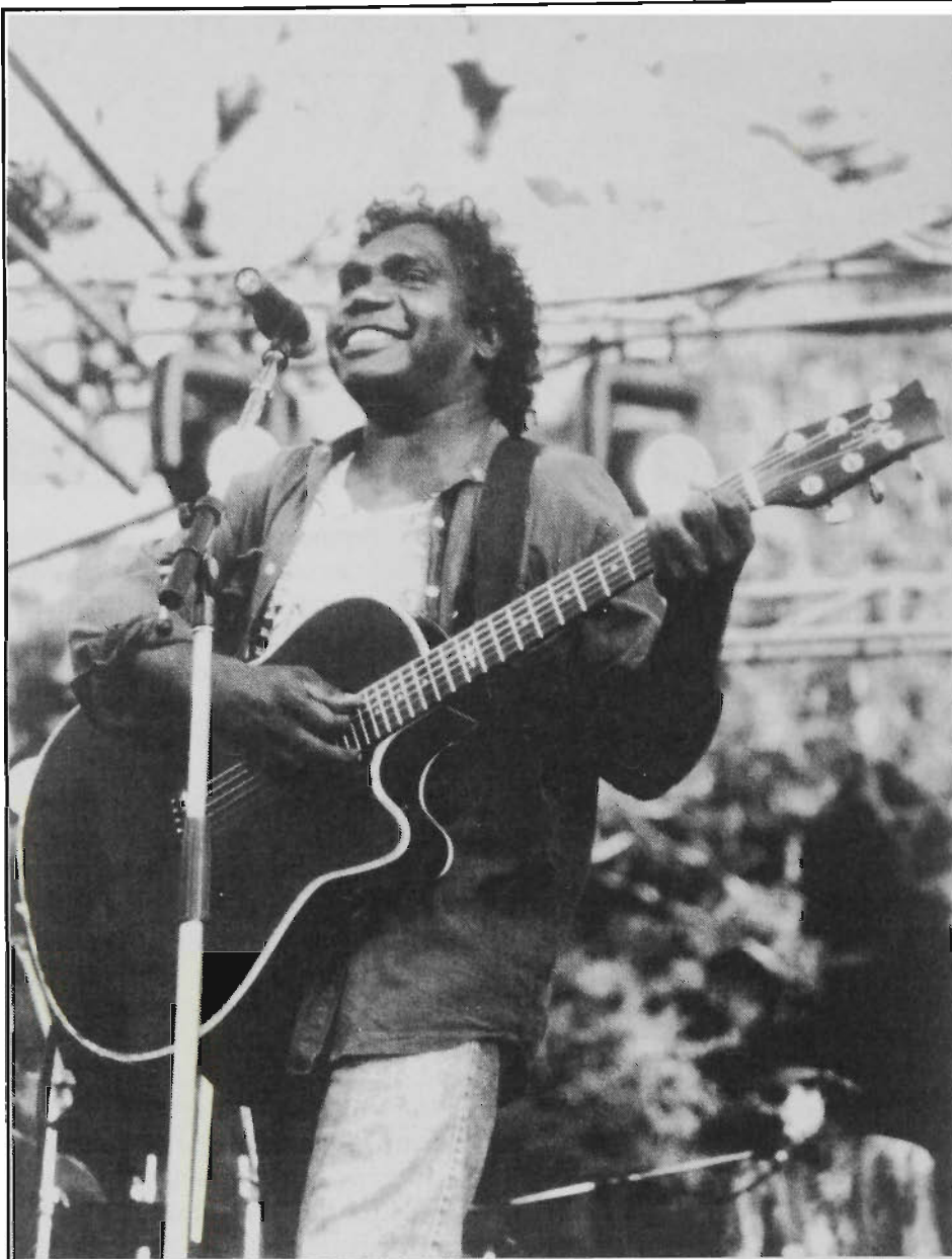
Australian of the Year and lead singer for Yothu Yindi, Mandawuy Yunupingu. The band will play at the University this month

The Wollongong University Australian University Games team is holding a quiz night in an effort to raise