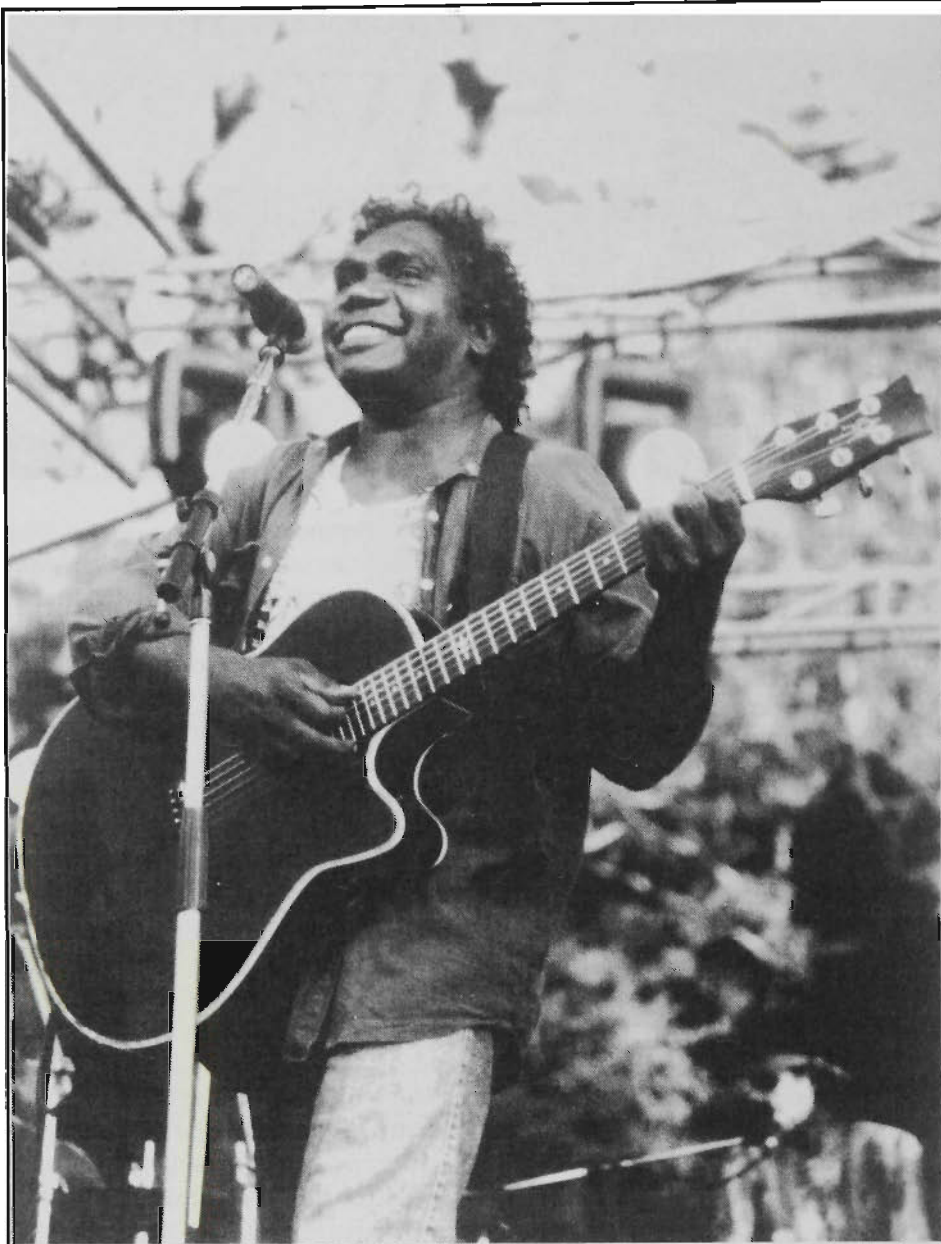
Australian of the Year and lead singer for Yothu Yindi, Mandawuy Yunupingu. The band will play at the University this month

The Wollongong University Australian University Games team is holding a quiz night in an effort to raise