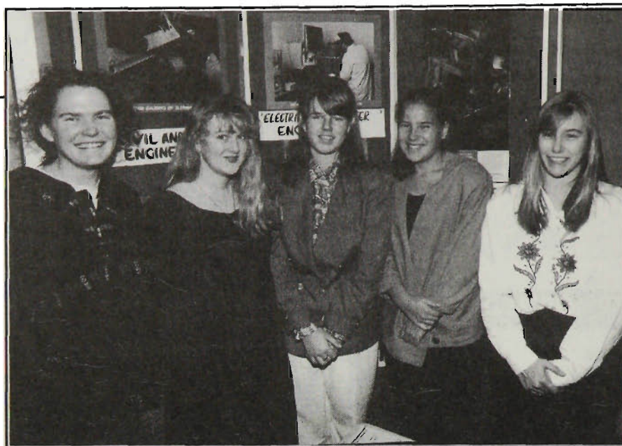
The recipients of Women in Engineering bursaries