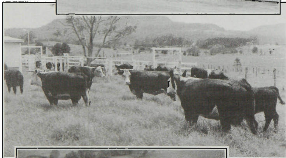
ABOVE: Some of the neighbours came to welcome the students LEFT: The complex with some of the Bull pens (right) used in the days when Graham Park was run by the NSW Department of Agriculture.

A formal opening will be held on 2 April to coincide with a University Council meeting to be held there. In the evening of the same day the Shoalhaven Alumni will have its inaugural meeting.