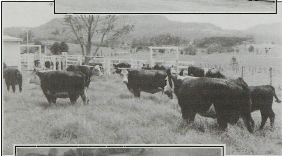
ABOVE: Some of the neighbours came to welcome the students LEFT: The complex with some of the Bull pens (right) used in the days when Graham Park was run by the NSW Department of Agriculture.

A formal opening will be held on 2 April to coincide with a University Council meeting to be held there. In the evening of the same day the Shoalhaven Alumni will have its inaugural meeting.