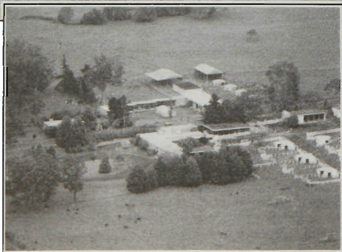
ABOVE: Some of the neighbours came to welcome the students LEFT: The complex with some of the Bull pens (right) used in the days when Graham Park was run by the NSW Department of Agriculture.