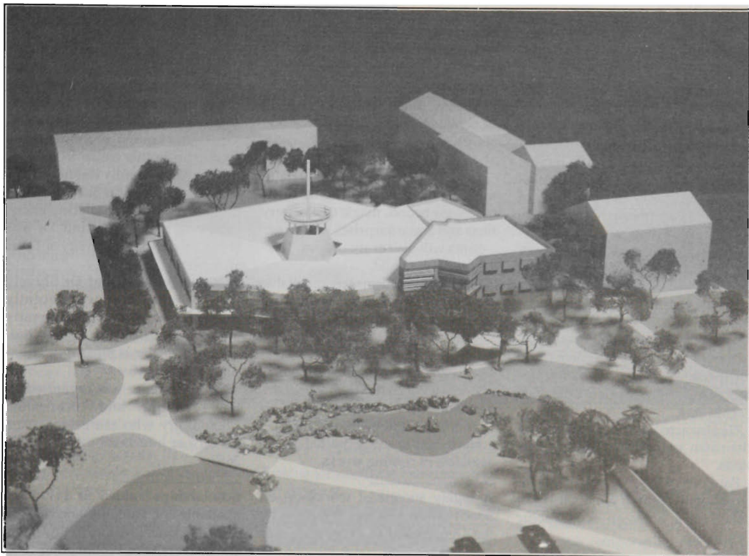
A model of the Pentagon reconstruction. The Administration Building is in the foreground. Building 19 is on the right.