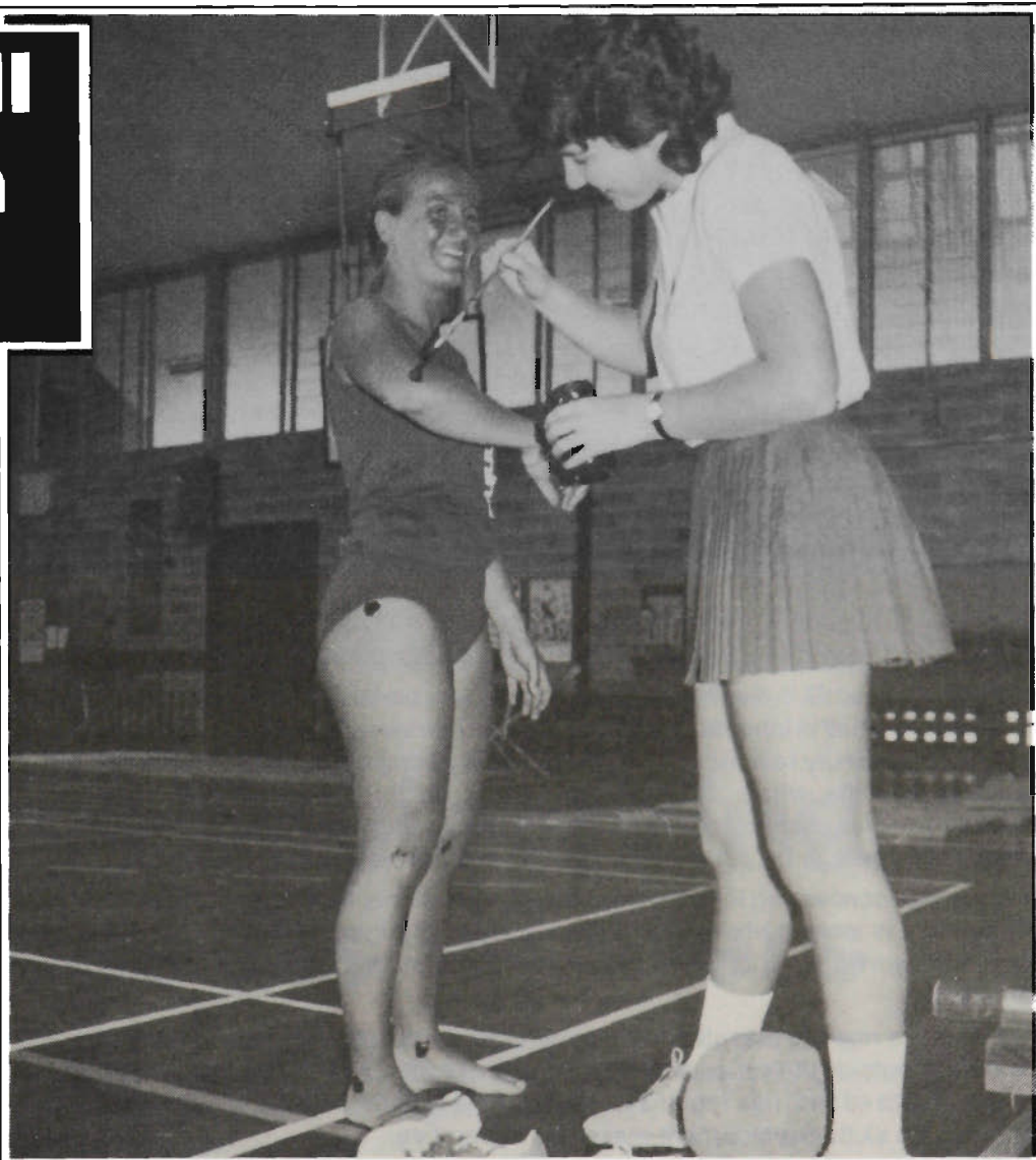
Preparing for research into netball injuries.