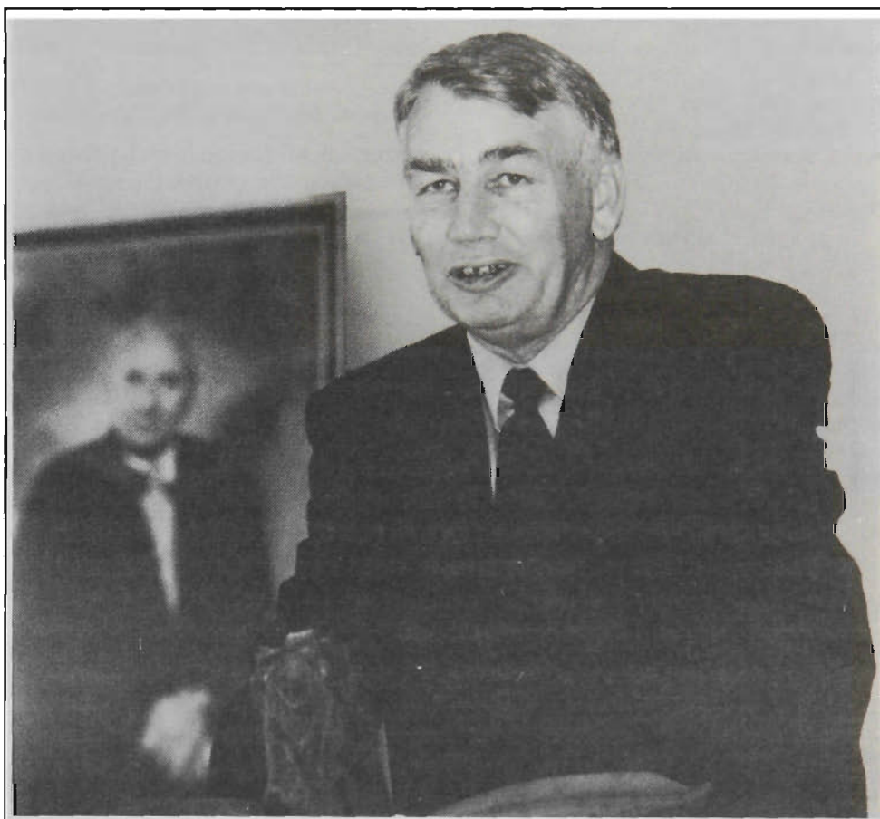
Mr Howe announcing the new health centre

One of the initial tasks of the centre will be to develop a multi-disciplinary, community-based approach to continuing education for those involved in primary health care.