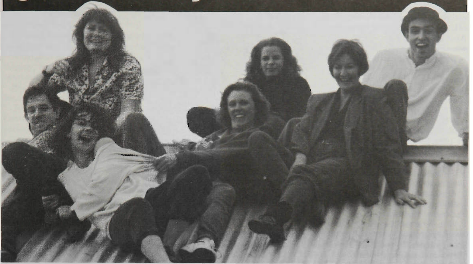
Members of the Tin Roof Theatre Company

The recently formed Tin Roof Theatre Company has returned to Wollongong after a very successful performance at the Adelaide Festival Fringe.