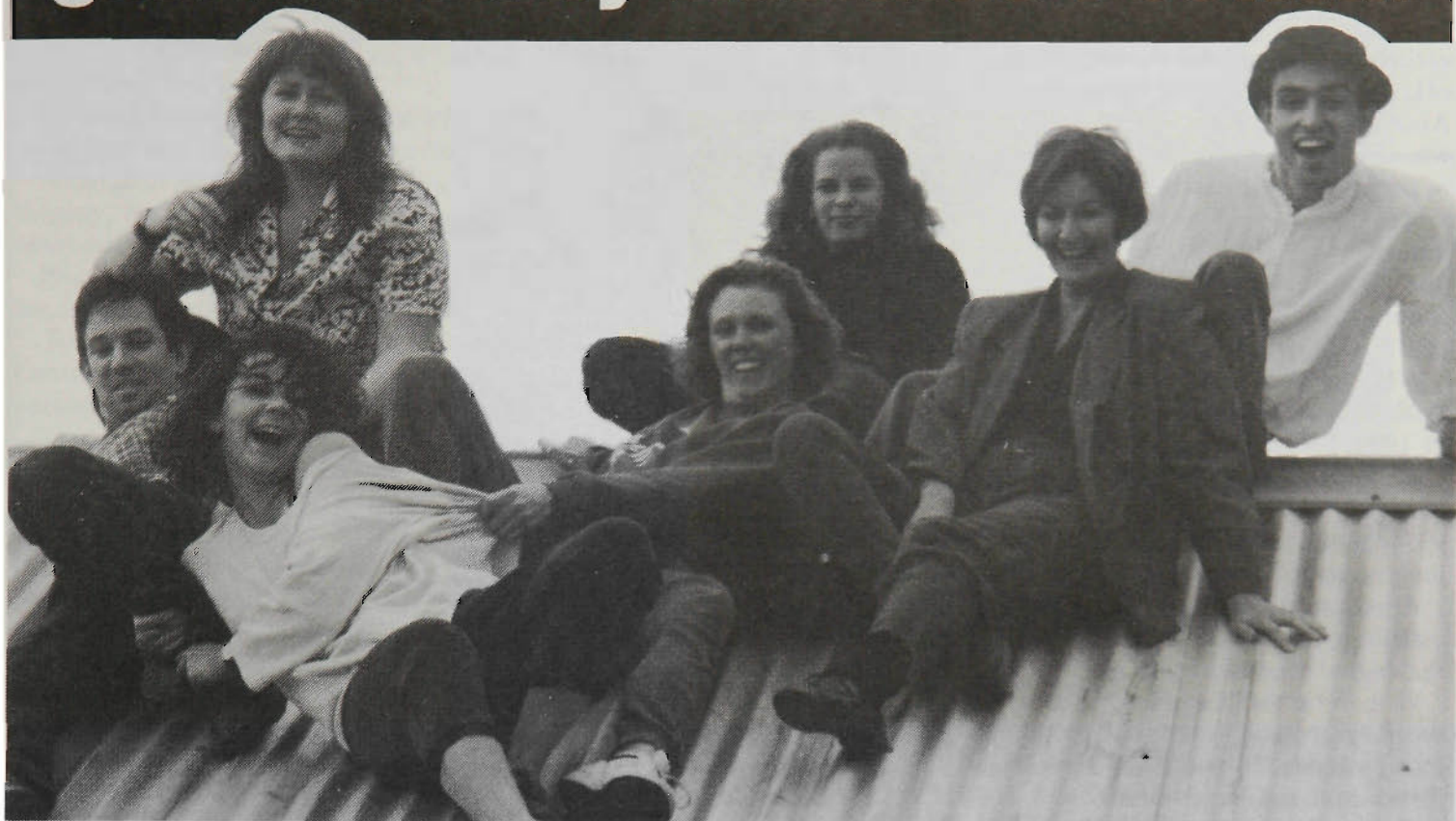
Members of the Tin Roof Theatre Company

The recently formed Tin Roof Theatre Company has returned to Wollongong after a very successful performance at the Adelaide Festival Fringe.