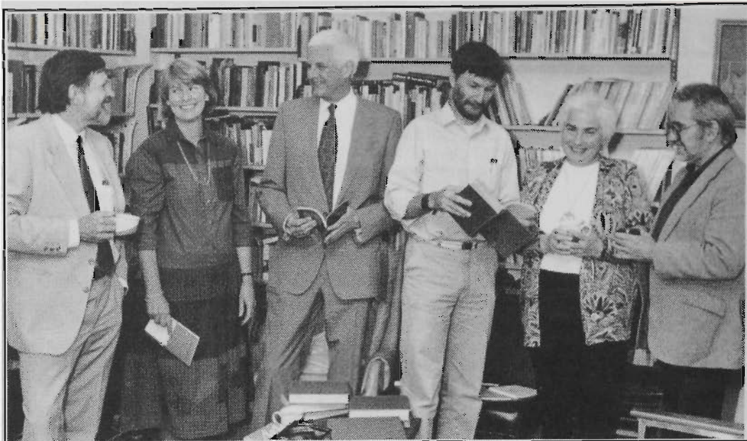
The British Council has presented the New Literatures Research Centre (NLRC) in the Department of English with an interesting collection of publications covering writers and their works from Beowulf to Virginia Woolf.