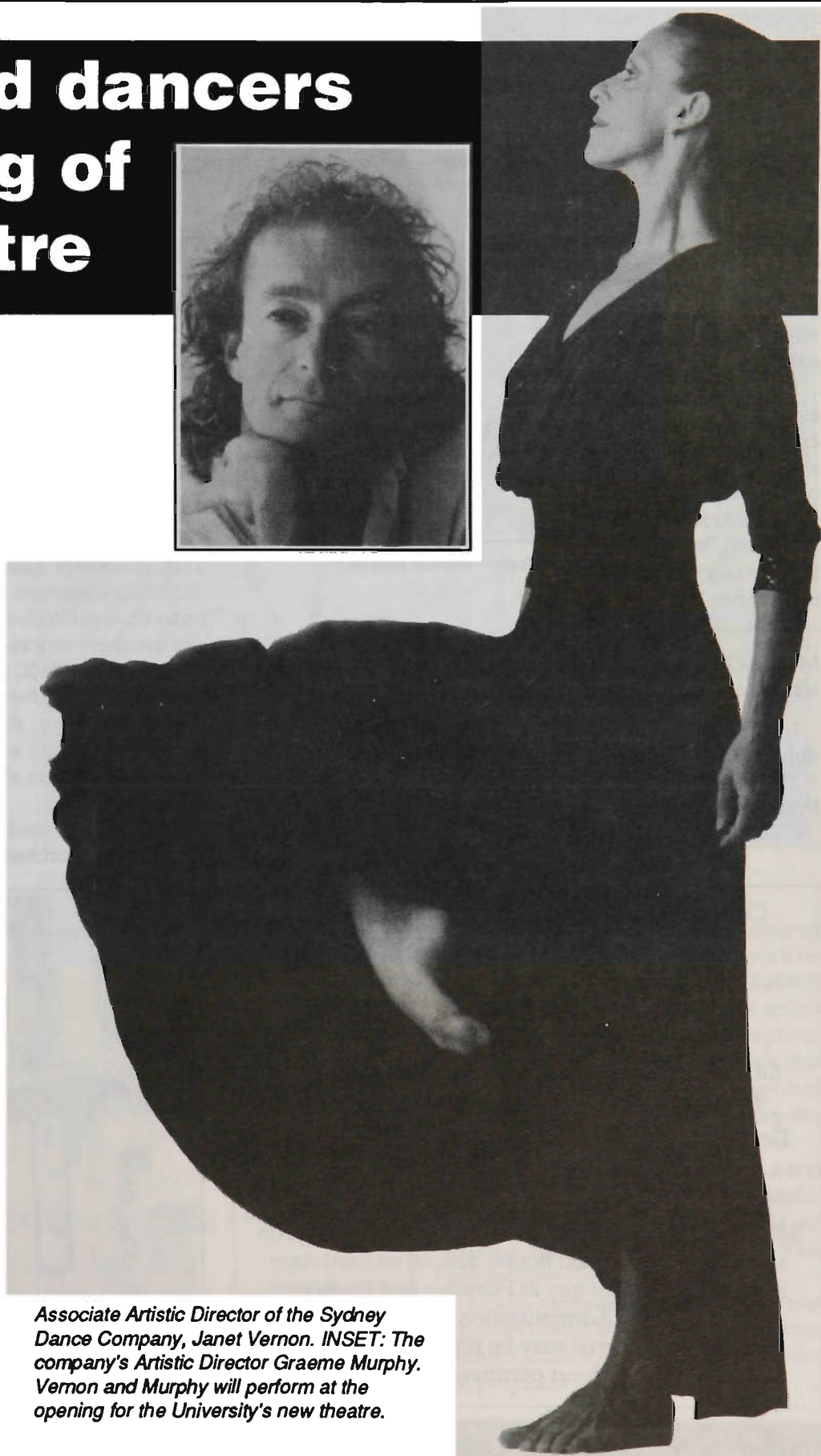
Associate Artistic Director of the Sydney Dance Company, Janet Vernon. INSET: The company's Artistic Director Graeme Murphy. Vernon and Murphy will perform at the opening for the University's new theatre.