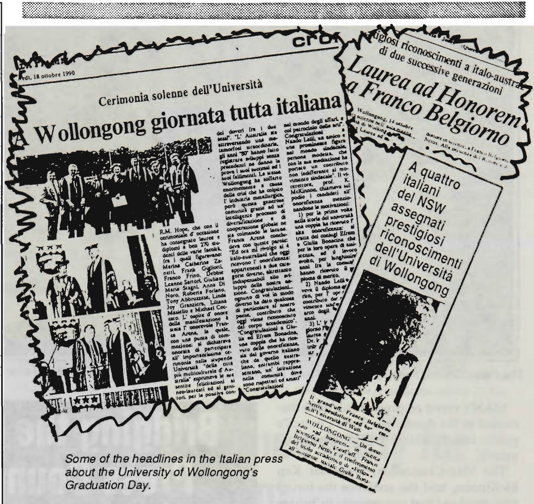
Some of the headlines in the Italian press about the University of Wollongong's Graduation Day.