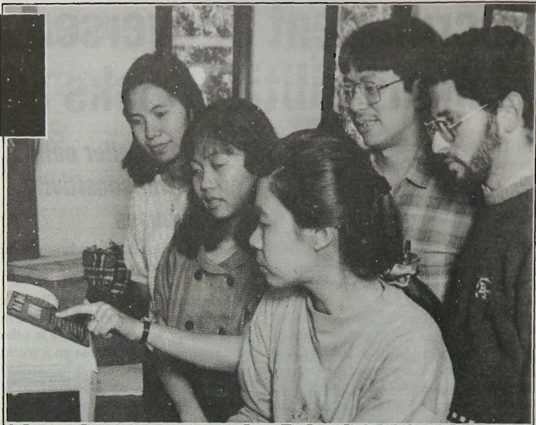
Some of the students, who came from the Philippines, Iran, Indonesia and China, at Polymer Systems Technology

Two instruments developed in Australia, the PDV 2000 (Chemtronics) and the ElectroLab (Polymer Systems Technology) were used for demonstration