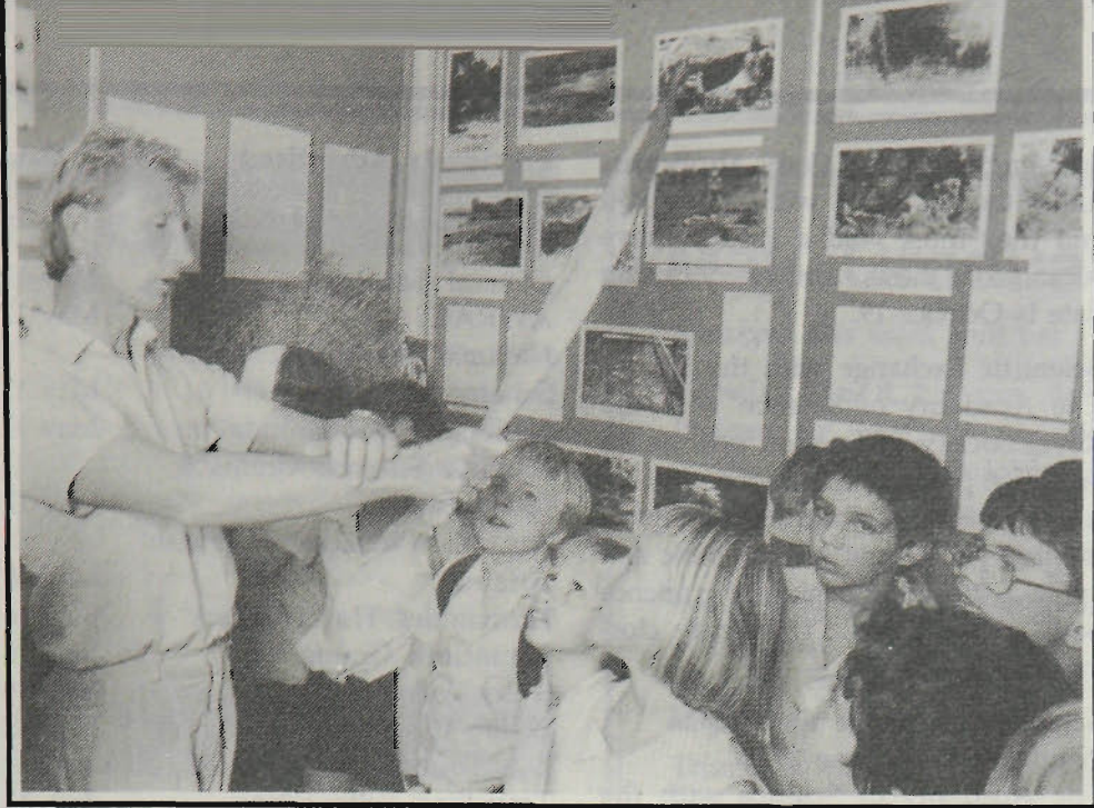
School children see an Aboriginal display in the Kemira Room of the Union Building