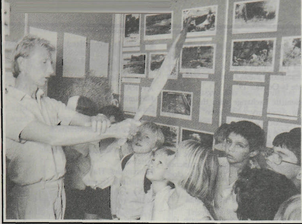
School children see an Aboriginal display in the Kemira Room of the Union Building