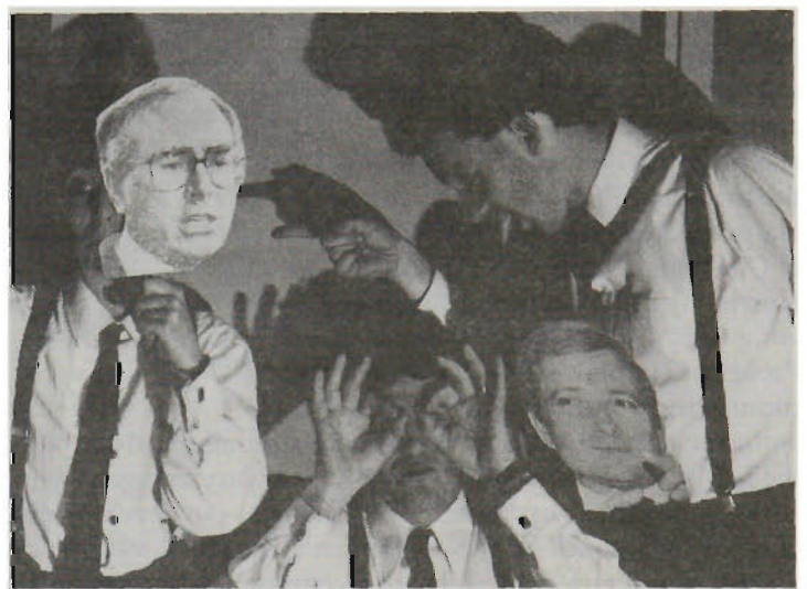
Above and below left, a state of disorder

Short Back and Sides are quite willing to take up the issue of Safe Sex and composed appropriate disarming and highly humorous material for the recent Safe Sex Day. Their piece de resistance , however, is their hip-hop rendition of Queensland politics known as 'The Fitzgerald Rap', the funkiest political treatise extant.