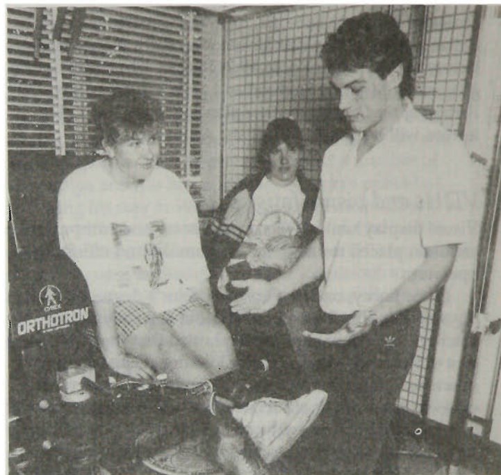
Human Movement students using the orthotron to test muscle strength

The area of Sports Medicine and rehabilitation through exercise is reaching new heights and much is planned for