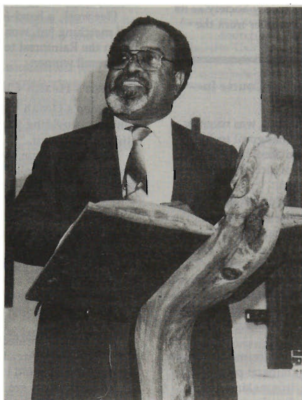
Michael Somare at the University

'These historical links', Mr Somare said, 'are now being strengthened through the presence of a growing number of Papua New Guinean students on the Wollongong campus – including some from the Prime Minister's as well as my own department.