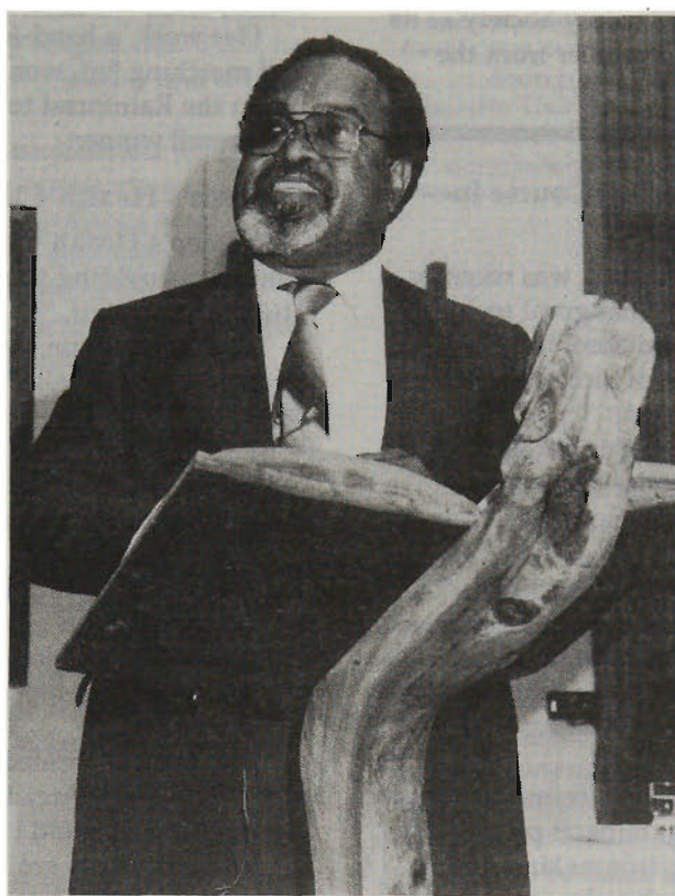
Michael Somare at the University

'These historical links', Mr Somare said, 'are now being strengthened through the presence of a growing number of Papua New Guinean students on the Wollongong campus – including some from the Prime Minister's as well as my own department.