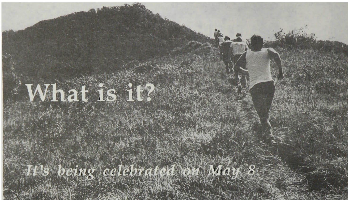
On again this year: the gruelling climb up the mountain

University Day , known previously as Anniversary Day, commemorates the establishment of the University as a College of the University of New South Wales in 1961. In formal terms, Wollongong University College was constituted by resolution of the Council of the University of New South Wales on 8 May 1961, making our University some 27 years old.