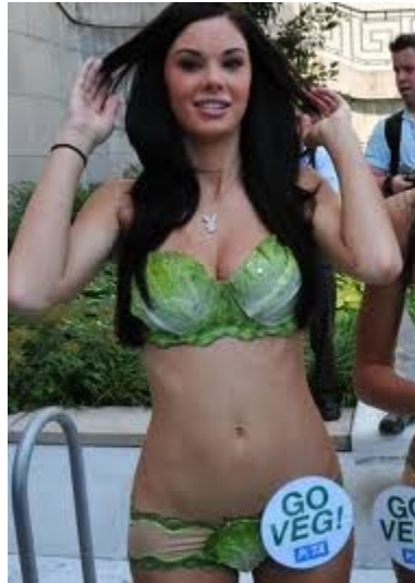
Figure 1 (Ad Punch): PETA’s ‘Lettuce Ladies’ and the ‘Ideal’ Body Type

(Kilbourne 397). 3 This ideal ‘is unattainable to most women, even if they starve themselves’ and only approximately the thinnest five per cent of women reach this ideal (Kilbourne 396). According to Kilbourne, the constant use of this female body type in advertising leads to women hating their bodies and hating themselves, resulting in ‘feelings of inferiority, anxiety, insecurity, and depression’, as well as playing a role in the increased prevalence of eating disorders (396, 398). Baran points out that PETA campaigns specifically continue the struggle that women and girls face with their bodies by drawing on and contributing to established social norms about ‘presentable’ bodies (47).