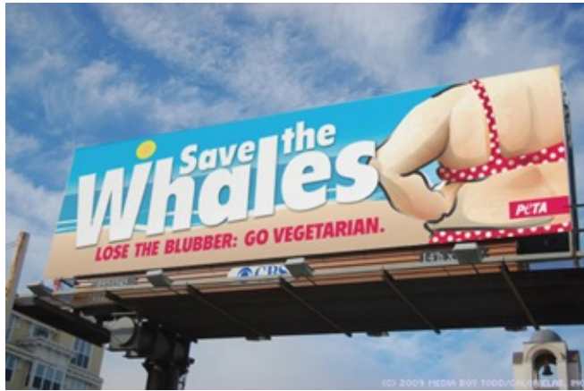
Figure 2 (Goldstein): PETA's 'Save the Whales' Billboard

After widespread public outrage, PETA took down the billboard and replaced it with one that read: 'GONE: Just like all the pounds lost by people who go vegetarian' (Goldstein). Even so, the fact that it ran the billboard in the first place demonstrates PETA's willingness to participate in some of the more troubling aspects of the advertising industry's representations of women. Advertising often features just parts of women, who are far more likely to be featured in parts. This reduces them to certain consumable body parts that are sexualised and used to sell products, rather than complete people (Baran 45). Feminist scholars have shown how this objectification in advertising can act to create a social climate that is dangerous for women (Bongiorno, Bain and Haslam 5). PETA campaigns that draw on these dominant representations of women in advertising cannot be said to directly cause violence, but they do contribute to a culture that views women as sexualised objects, which can be linked to violence against women (Jean Kilbourne, cited in Gill 255). The dangerous implications of PETA campaigns relying on representations that commodify and objectify women are significant, even if the sexualisation is experienced as empowerment for the individual women participating in the campaigns (Deckha 55-56).