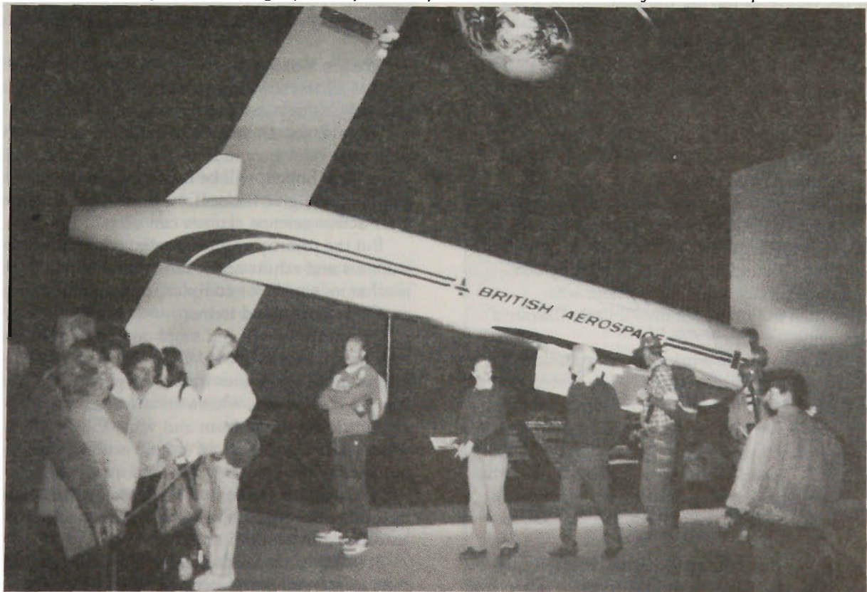
The biggest 'item' brought from Expo is this futuristic HOTOL, donated by British Aerospace