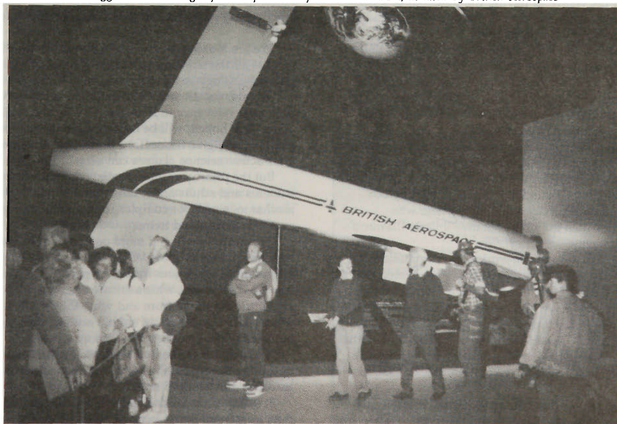
The biggest 'item' brought from Expo is this futuristic HOTOL, donated by British Aerospace