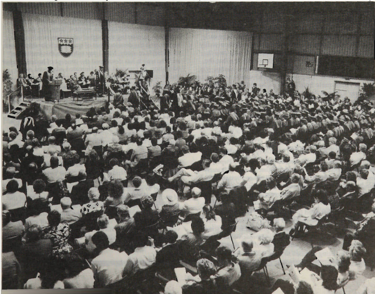
The graduation ceremony — on this occasion held in the Sports Hall of the Recreation and Sports Association