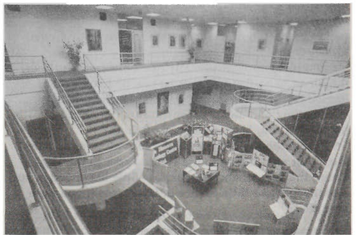
The Illawarra Technology Centre – an acknowledged chef-d'oeuvre by the University's architects

The firm's designs are in the main imaginative, innovative, practical and attractive, and are created to