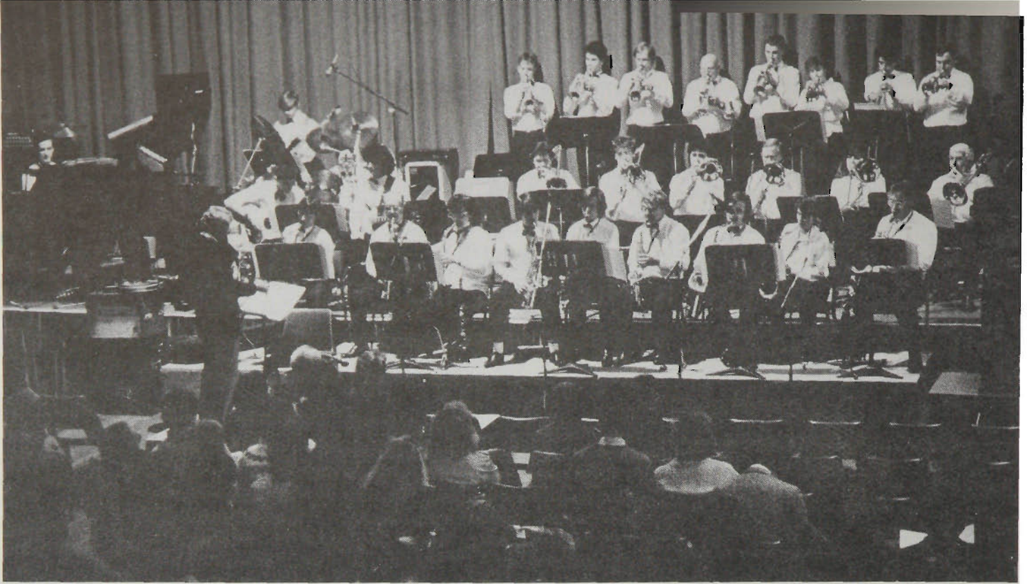
Earning plaudits – The Don Harper University/Conservatorium Big Band. The band's progression, since its formation in 1985, is discussed below

students, was an excellent addition to the public university system which had served Australia so well.