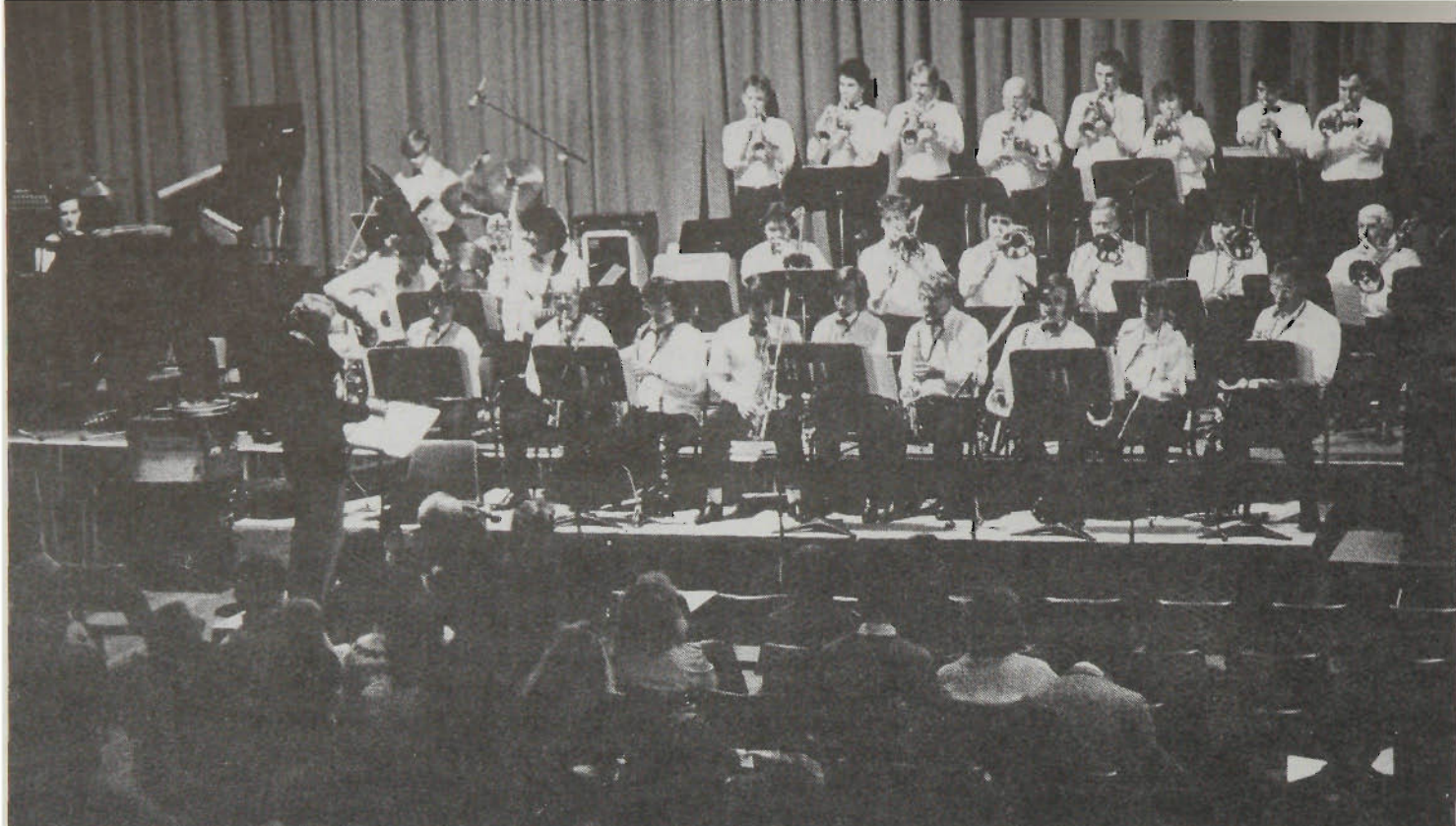
Earning plaudits – The Don Harper University/Conservatorium Big Band. The band's progression, since its formation in 1985, is discussed below

students, was an excellent addition to the public university system which had served Australia so well.