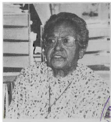
Guest Speaker at the Graduation Ceremony for graduands in Education was Oodgeroo, who took as her theme the plight of the Australian Aborigines living in a white society. She pleaded for universities to lead the way in forcing government to recognise Aboriginal educational needs

schools executive firmer powers to deal with those few fairly destructive students.