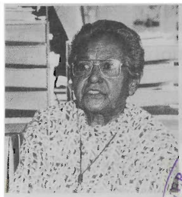
Guest Speaker at the Graduation Ceremony for graduands in Education was Oodgeroo, who took as her theme the plight of the Australian Aborigines living in a white society. She pleaded for universities to lead the way in forcing government to recognise Aboriginal educational needs

schools executive firmer powers to deal with those few fairly destructive students.