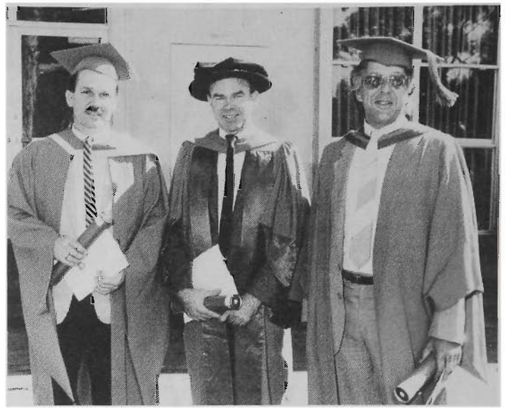
The Occasional Address at the first of the May graduation ceremonies was given by the noted Australian historian, Professor Manning Clark, seen on the left, who posed the question: Who owns Australia? and challenged students to answer that question