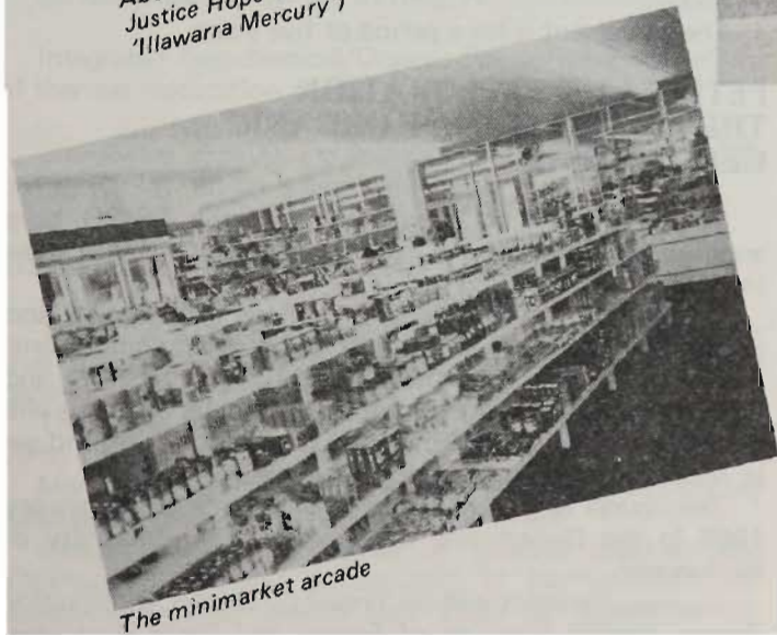
The minimarket arcade