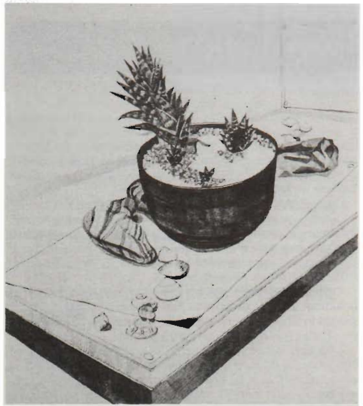
Still life by David Cowie

WICAT Systems Pacific Pty Ltd has kindly agreed to provide an eight workstation CBE system for a two-week trial to begin on October 26. Interested departments, schools, centres and individuals are urged not to miss this opportunity for extensive demonstration and evaluation.