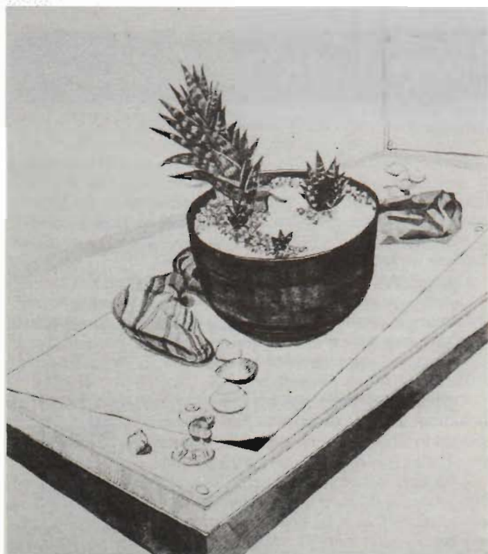
Still life by David Cowie

WICAT Systems Pacific Pty Ltd has kindly agreed to provide an eight workstation CBE system for a two-week trial to begin on October 26. Interested departments, schools, centres and individuals are urged not to miss this opportunity for extensive demonstration and evaluation.