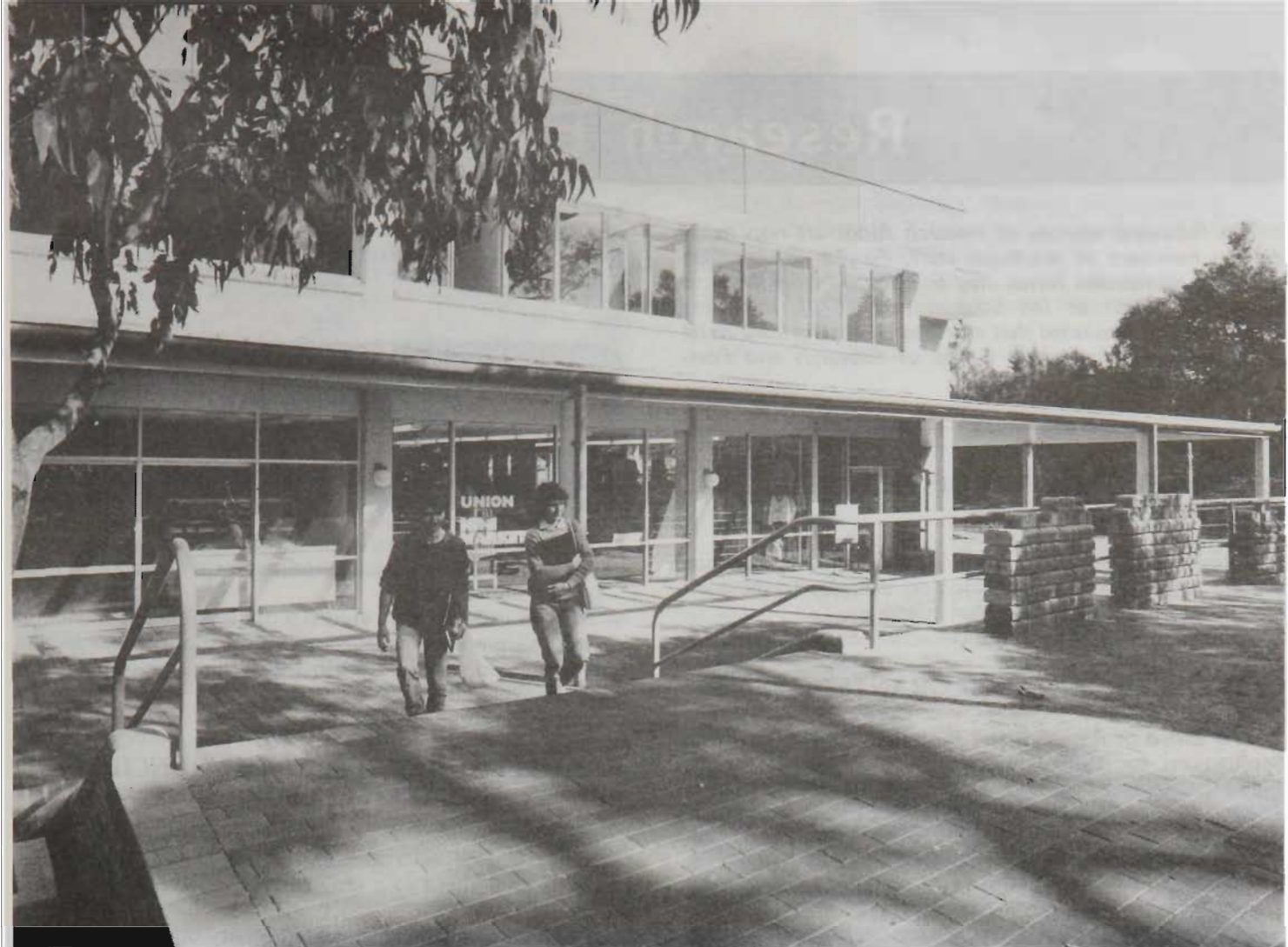
The new Union Commercial Centre