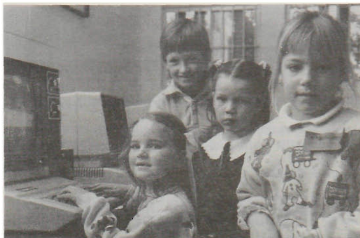
Four young computer aspirants at the Kids Computing class held recently in the microcomputer laboratories

Another very successful Kids Computing Program was held over the school holiday period utilising the Micro-