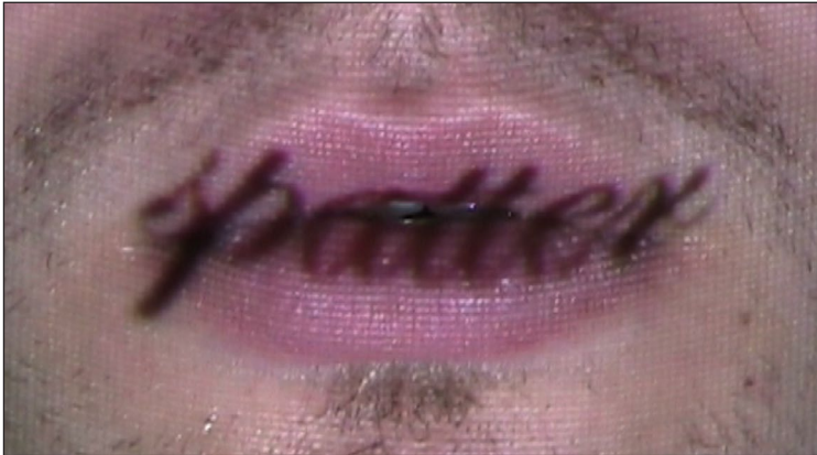
Figure 1 Carolyn McKay 2009 Fragments Digital video still on cotton rag 68 x 108 cm

Similarly in a murder trial, the event is not present, but must be created — the crime scene implied and evoked through spoken word and the display of remnant physical evidence, both the banal and the blood-spattered.