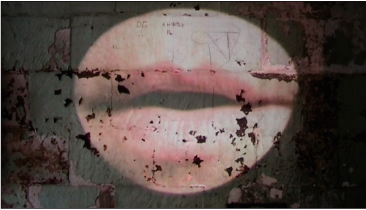
Figure 3 Carolyn McKay 2009 Oath Digital video on DVD 02:04 min looped

My digital video work Oath has a whispered audio track as a mouth appears on the textured wall of a former police station, The Lock-Up in Newcastle. The mouth opens, suggesting a speech act and creating tension in the expectation of a monologue, but then it slowly closes and dissolves without speaking. This work explores the unspeakable, un-narratable moments of testimony and the unavoidable elisions in verbal expression.