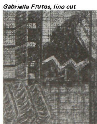
Gabriella Frutos, lino cut