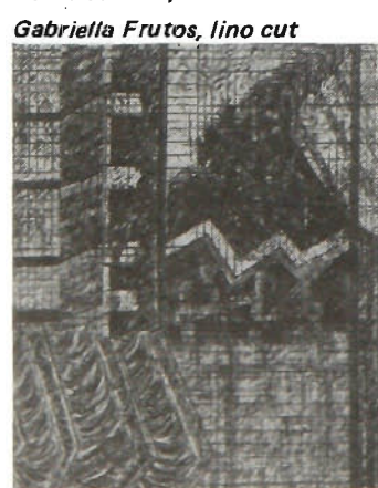
Gabriella Frutos, lino cut