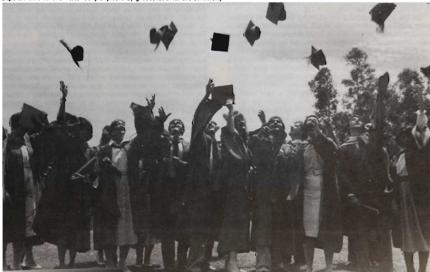
Caps are thrown enthusiastically skyward by graduates after the ceremony