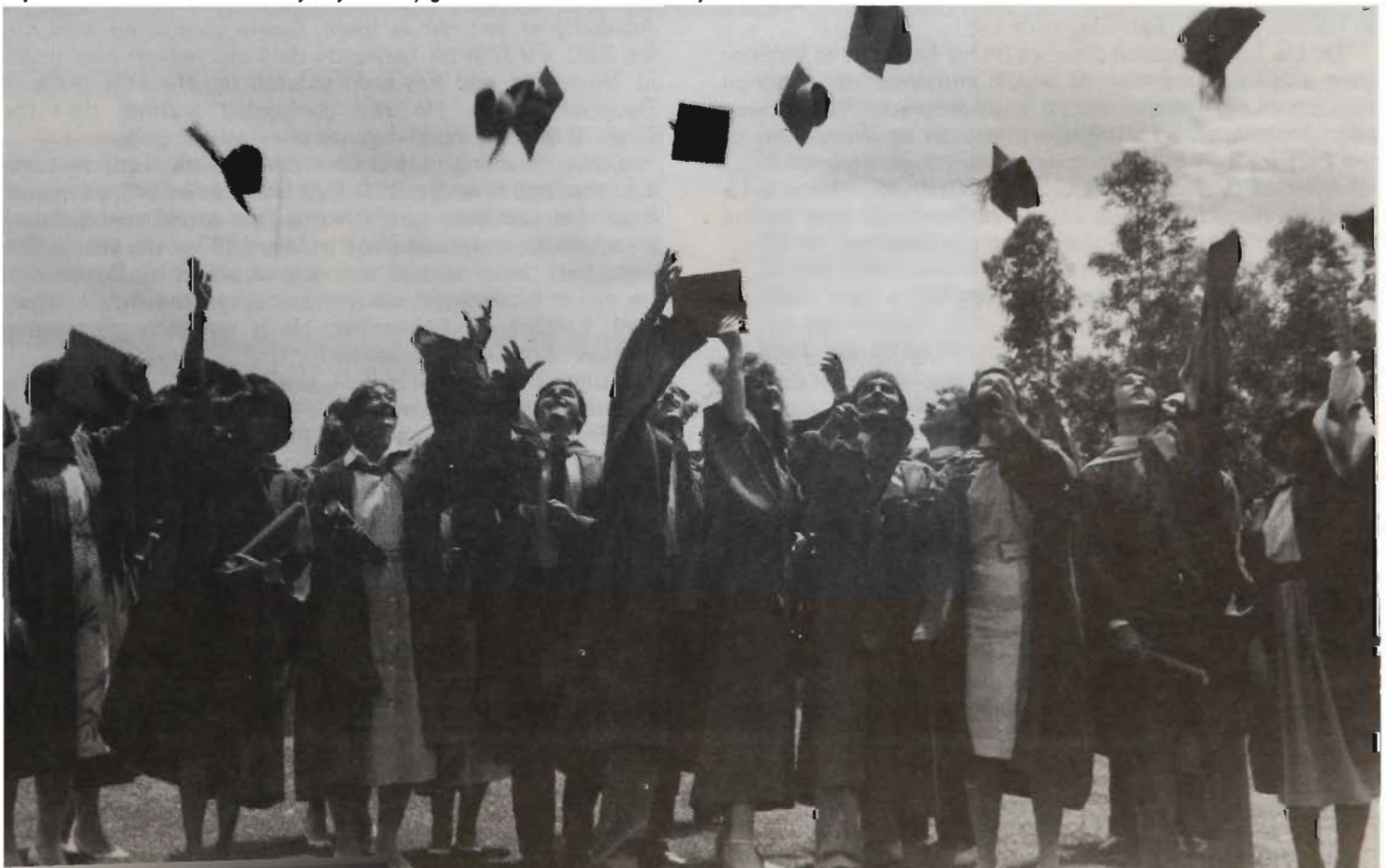
Caps are thrown enthusiastically skyward by graduates after the ceremony