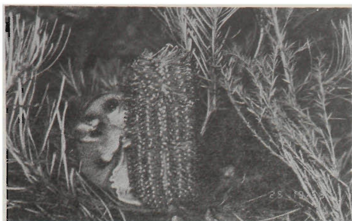
Sugar glider visiting a Banksia inflorescence (see 'Research Grant')

of biology; genetics, plant reproductive biology and animal behaviour. This intergration is necessary to establish how pollinator behaviour determines plant seed production in Banksia species. One major difficulty is that mammals are important pollinators and they are nocturnal. Indirect techniques are therefore required to monitor mammal activity.