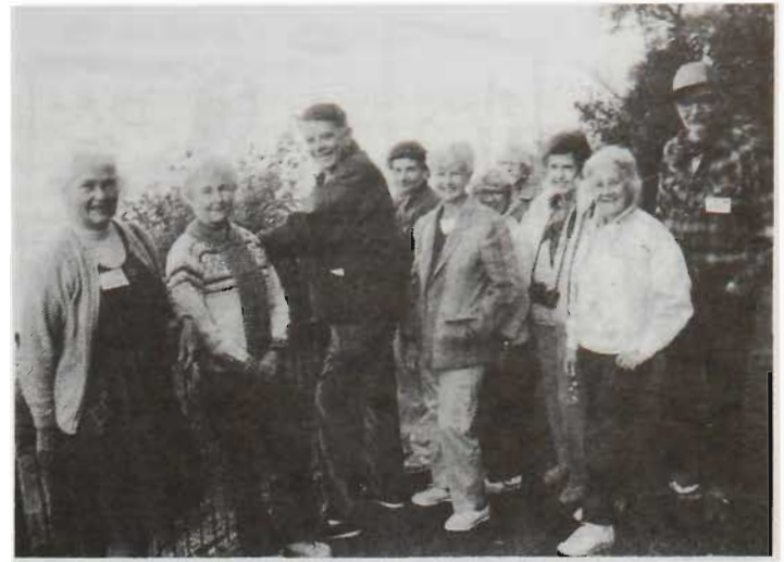
Earlier this month, this Elderhostel group of US visitors is sight-seeing at Mount Kembla

The Australian College for Seniors will be holding 40 three-week programs in Australian and New Zealand Universities and Colleges of Advanced Education from December 1986 to February 1987. Each program will have approximately 40 senior Americans on it and will be