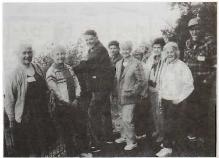
Earlier this month, this Elderhostel group of US visitors is sight-seeing at Mount Kembla

The Australian College for Seniors will be holding 40 three-week programs in Australian and New Zealand Universities and Colleges of Advanced Education from December 1986 to February 1987. Each program will have approximately 40 senior Americans on it and will be